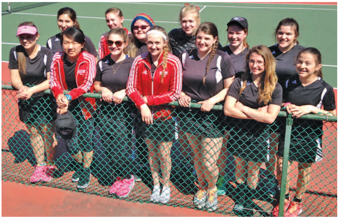
The East Jordan tennis team break for a photo opportunity.