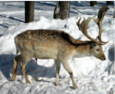
Wildlife viewing of exotic fallow deer and other animals will be made more accessible by the AmeriCorps Otsego Environmental Learning project near Aspen Park.